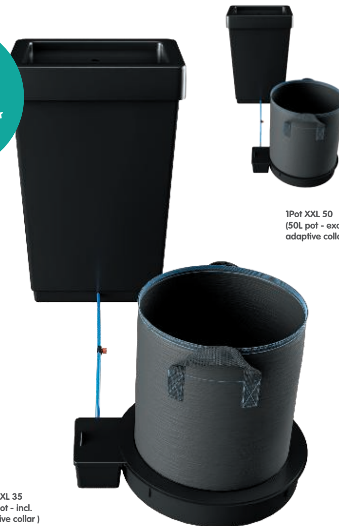
1Pot XXL 50 (50L pot - excl. adaptive collar)

Allow your plants to establish before turning your system on.